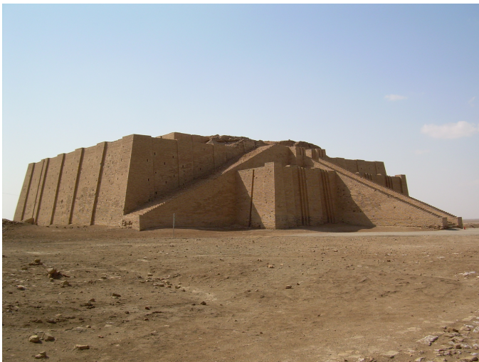
The Ziggurat of Ur, constructed approximately 200 years after Enheduanna's death

Enheduanna's father, Sargon, conquered many city states in Mesopotamia to create the Akkadian empire. This empire lasted approximately 180 years, from 2334 BCE to 2154 BCE.